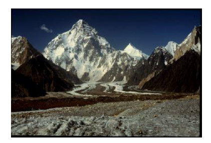
Base of K2

View this asset at: <a href="http://www.awesomestories.com/asset/view/Base-Camp-at-K2">http://www.awesomestories.com/asset/view/Base-Camp-at-K2</a>