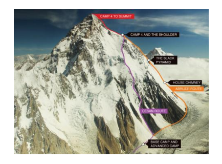
Base Camp at K2