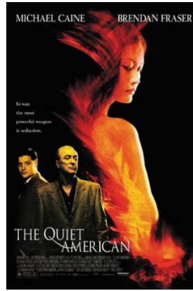
Image of The Quiet American movie poster. Copyright Miramax Films, all rights reserved. Image provided here as fair use for educational purposes. Online via Wikimedia Commons.

I never knew a man who had better motives for all the trouble he caused.