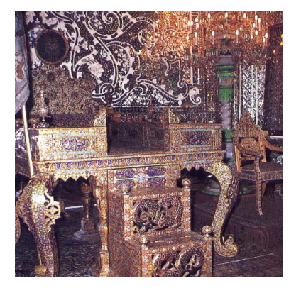
<u>Shah Jahan - Peacock Throne</u> Photo online, courtesy British Library. View this asset at:

http://www.awesomestories.com/asset/view/Shah-Jahan-Peacock-Throne