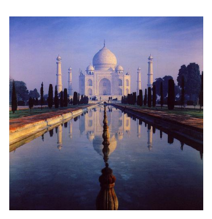
THE TAI MAHAL

View this asset at: <a href="http://www.awesomestories.com/asset/view/Crypt-in-the-Taj-Mahal">http://www.awesomestories.com/asset/view/Crypt-in-the-Taj-Mahal</a>