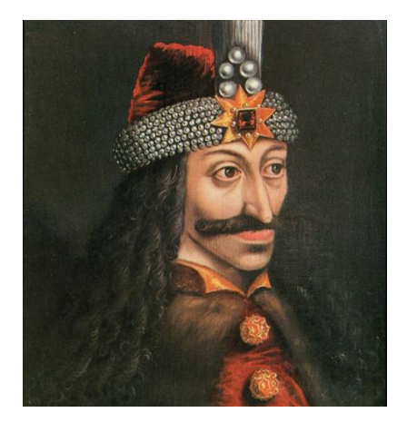
Dracula - Vlad III

View this asset at: <a href="http://www.awesomestories.com/asset/view/Asia-Minor-Map">http://www.awesomestories.com/asset/view/Asia-Minor-Map</a>