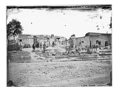
Soldier's Hanging Laundry