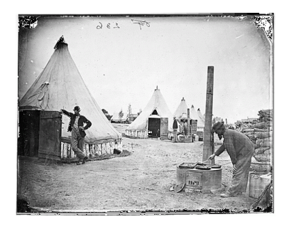
Cook Tents during the Civil War

View this asset at: <a href="http://www.awesomestories.com/asset/view/Field-Cooks">http://www.awesomestories.com/asset/view/Field-Cooks</a>