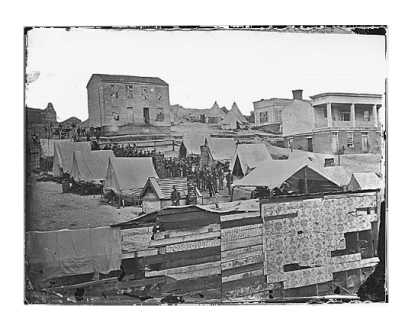
Civil War Soldiers Lived in Tents