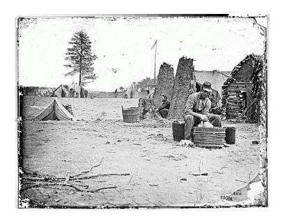
Soldiers Washing Clothes in the Field