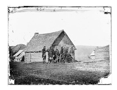
Officer Quarters in Winter