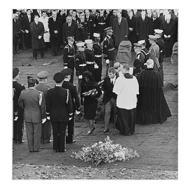
Mrs. Kennedy with the Coffin Flag U.S. National Archives, image 18-2585a.

View this asset at: http://www.awesomestories.com/asset/view/Mrs.-Kennedy-with-the-Coffin-Flag