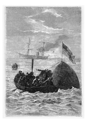
Image online, courtesy <u>depauw.edu</u> website. View this asset at: <u>http://www.awesomestories.com/asset/view/Journey-to-the-Bottom-of-the-Sea</u>

Jules Verne - Prophetic Splashdown after Space Mission Image online, courtesy <u>depauw.edu</u> website. PD View this asset at: