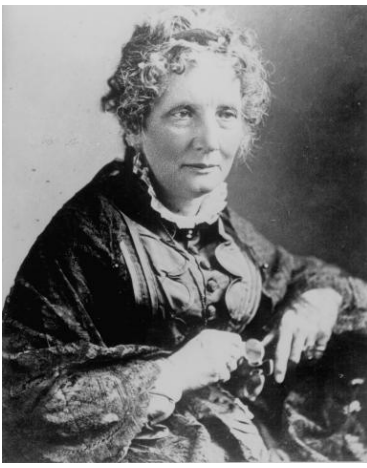
Photo - Harriet Beecher Stowe