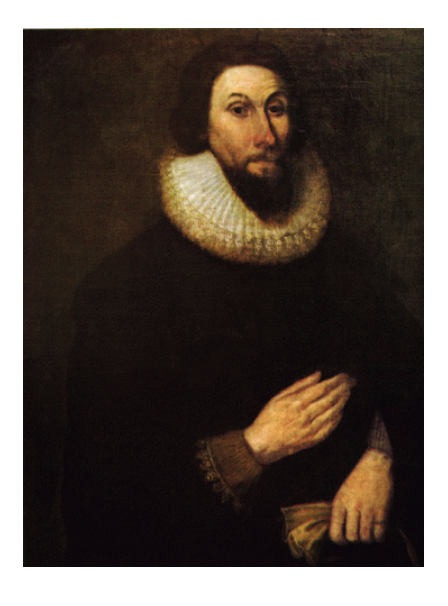
<u>John Winthrop</u> Image online courtesy, Wikimedia Commons. View this asset at: <a href="http://www.awesomestories.com/asset/view/John-Winthrop">http://www.awesomestories.com/asset/view/John-Winthrop</a>