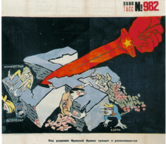
Image online, courtesy Russian State Archives. View this asset at: <u>http://www.awesomestories.com/asset/view/Stalingrad-Battle-Scene</u>

Под дараже Пранова Арике трелит и разлативати Баки назвателая гордаратся. Страх и натетелен цорт нако прад руминских, контерских, накоторских, локольности Татакуа. Факиа Булики об таки. В 2 К. В. Вилии и об так.