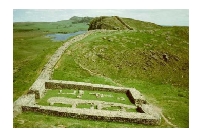
Photo of Milecastle 48 by Tall Guy, online courtesy Flickr. Copyright Tall Guy - all rights reserved. View this asset at: <a href="http://www.awesomestories.com/asset/view/Hadrian-s-Wall-Milecastle-48">http://www.awesomestories.com/asset/view/Hadrian-s-Wall-Milecastle-48</a>