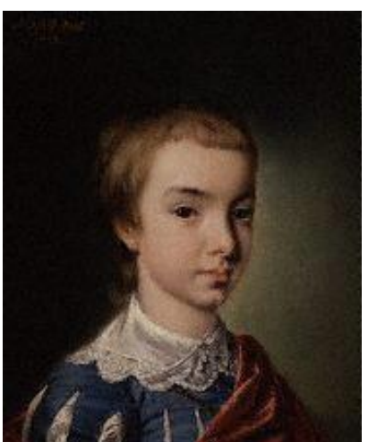
William Wilberforce - As a Young Boy

http://www.awesomestories.com/asset/view/William-Wilberforce-Portrait