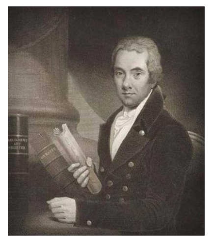
William Wilberforce Portrait