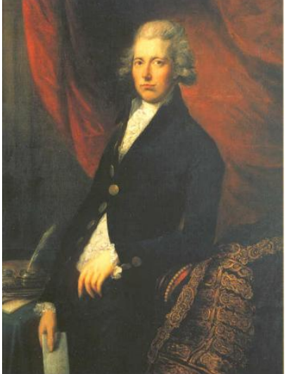
William Pitt the Younger

http://www.awesomestories.com/asset/view/Hull-A-Town-in-England