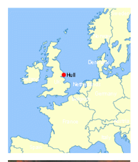
Hull - A Town in England