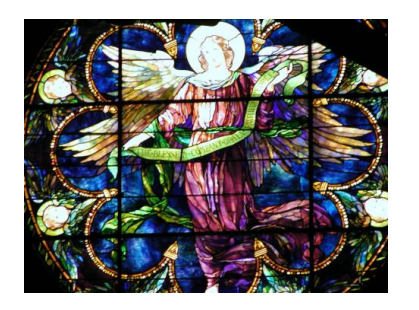
<u>Tiffany Window - St. Saviours, Bar Harbor</u> View this asset at: <a href="http://www.awesomestories.com/asset/view/Tiffany-Window-St.-Saviours-Bar-Harbor">http://www.awesomestories.com/asset/view/Tiffany-Window-St.-Saviours-Bar-Harbor</a>