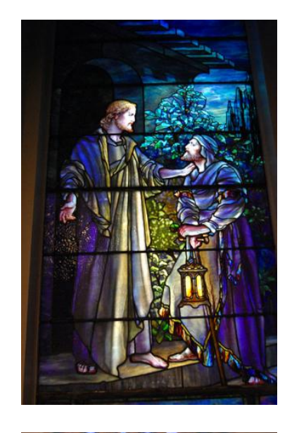
<u>Tiffany Window - First Presbyterian, Lockport</u>