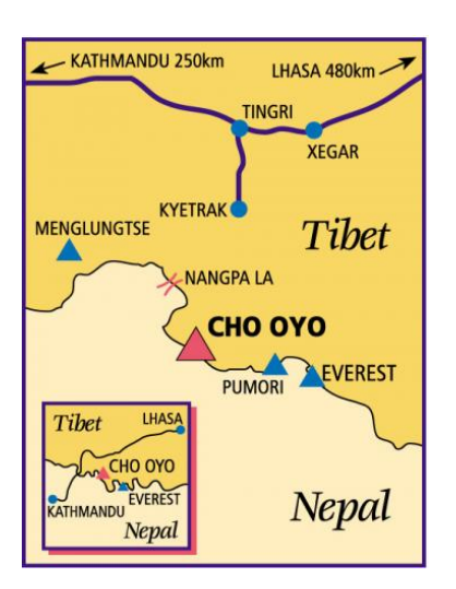
Image online, courtesy Wikimedia Commons. License: CC BY-SA 3.0. View this asset at: <a href="http://www.awesomestories.com/asset/view/Cho-Oyu">http://www.awesomestories.com/asset/view/Cho-Oyu</a>