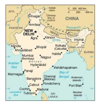
Image online, courtesy Wikimedia Commons. License: CC BY-SA 3.0. View this asset at: <a href="http://www.awesomestories.com/asset/view/Kanchenjunga">http://www.awesomestories.com/asset/view/Kanchenjunga</a>