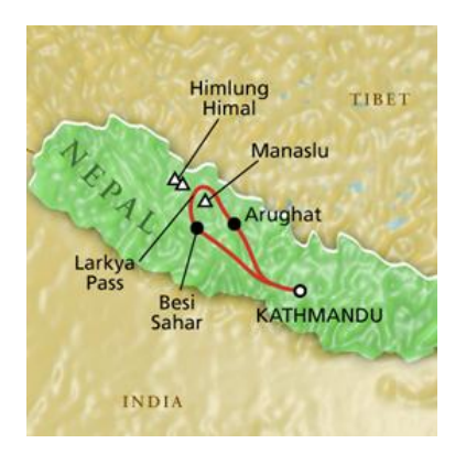
Image online, courtesy Wikimedia Commons. License: CC BY 2.0. View this asset at: <a href="http://www.awesomestories.com/asset/view/Manaslu">http://www.awesomestories.com/asset/view/Manaslu</a>