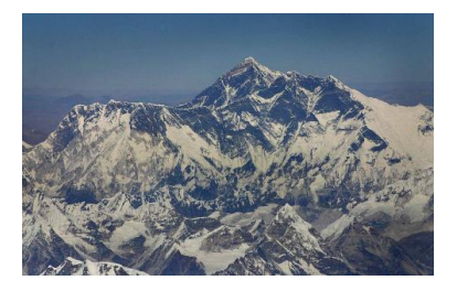
Image online, courtesy Wikimedia Commons. License: CC BY-SA 3.0. View this asset at: http://www.awesomestories.com/asset/view/Lhotse-South-Face