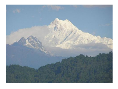
Image online, courtesy Wikimedia Commons. License: CC BY-SA 2.0. View this asset at: <a href="http://www.awesomestories.com/asset/view/Baltoro-Glacier">http://www.awesomestories.com/asset/view/Baltoro-Glacier</a>