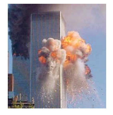
WTC South Tower - Struck at 80th Floor Image online, courtesy Wikimedia Commons.