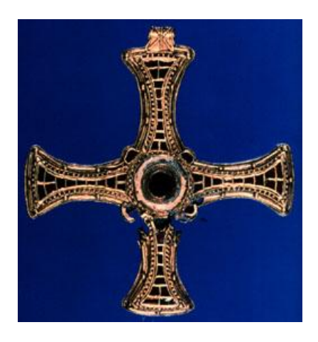
<u>Cross of St. Cuthbert</u>