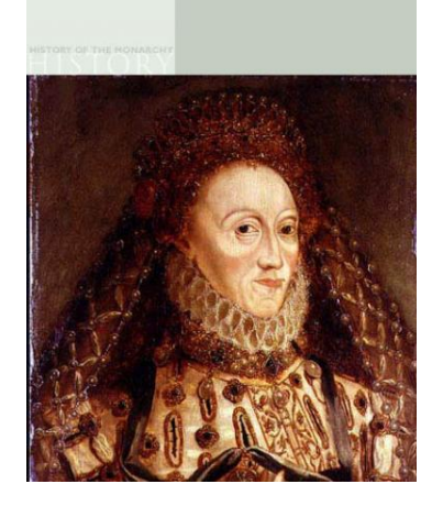
Elizabeth I - Later Years

\underline{http://www.awesomestories.com/asset/view/Defeat-of-the-Spanish-Armada-by-William-W.-Lace}