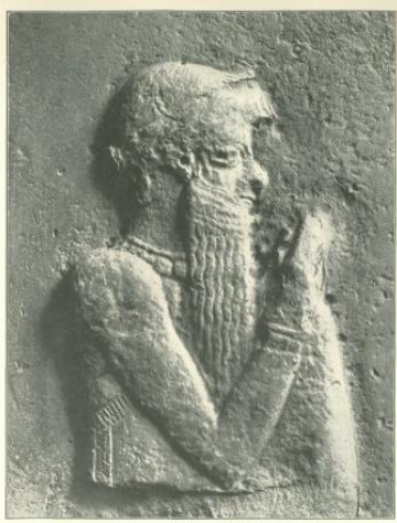
Portrait-sculpture of Hammurabi, King of Babylon. From a stone slab in the British Museum.