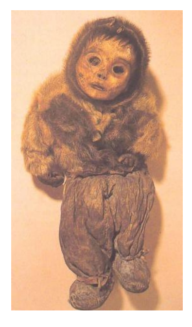
Photo online, courtesy NOAA. View this asset at: http://www.awesomestories.com/asset/view/Greenland-Iceberg-Beauty-on-the-Water

Qilakitsoq Mummy - Remarkably Preserved Image online, courtesy Wikimedia Commons. View this asset at: http://www.awesomestories.com/asset/view/Qilakitsoq-Mummy-Remarkably-Preserved