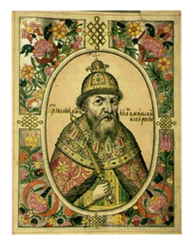
An Elderly Ivan IV