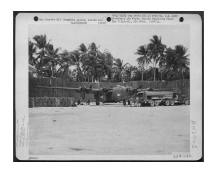
Flying Coffin - Nickname for B-24s View this asset at:

\underline{http://www.awesomestories.com/asset/view/Flying-Coffin-Nickname-for-B-24s}