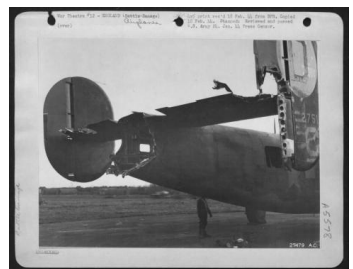
Photo of B-24M-5-FO Liberator - s/n 44-50468 - online, courtesy U.S. National Archives. View this asset at: http://www.awesomestories.com/asset/view/Crashing-on-Take-off-B-24