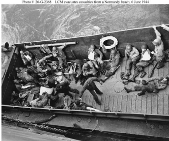
Photo # 26-G-2368 LCM evacuates casualties from a Normandy beach, 6 June 1944

http://www.awesomestories.com/asset/view/Transferring-Casualties-Onto-the-Transport-Ship