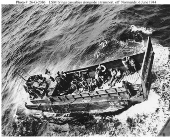
Photo # 26-G-2386 LSM brings casualties alongside a transport off Normandy, 6 June 1944

View this asset at: http://www.awesomestories.com/asset/view/Evacuating-Wounded-Troops