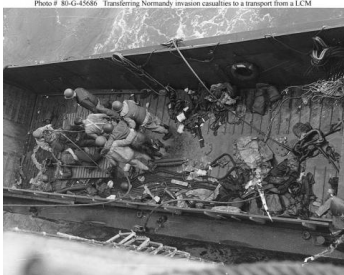
Photo # 80-G-4506 Transferring Normandy invasion casualties to a transport from a LCM

http://www.awesomestories.com/asset/view/Casualties-Along-Side-a-Transport-Ship