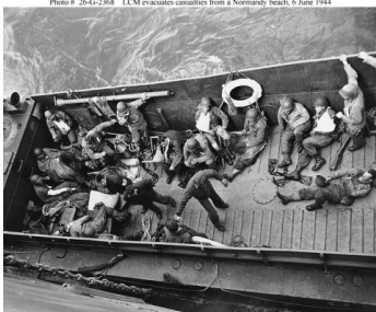
Photo # 26-G-2368 LCM evacuates casualties from a Normandy beach, 6 June 1944

http://www.awesomestories.com/asset/view/Transferring-Casualties-Onto-the-Transport-Ship