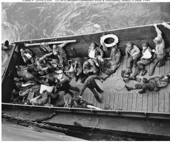
Photo # 26-G-2368 LCM evacuates casualties from a Normandy beach, 6 June 1944

View this asset at: http://www.awesomestories.com/asset/view/Dead-Soldiers-on-Omaha-Beach