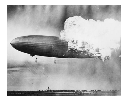
<u>Hindenburg - Water Ballast Falls to the Ground</u>