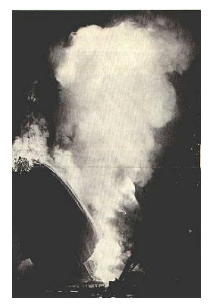
Hindenburg's Nose Engulfed in Flames

http://www.awesomestories.com/asset/view/Hindenburg-Water-Ballast-Falls-to-the-Ground