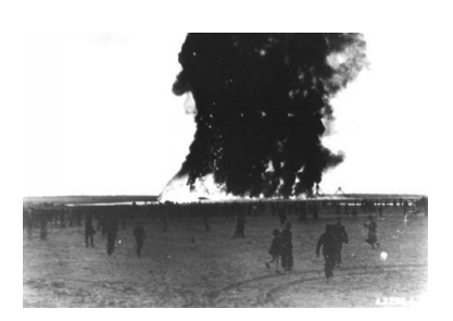
Airship Hindenburg Completely Destroyed

View this asset at: <a href="http://www.awesomestories.com/asset/view/Hindenburg-Fire">http://www.awesomestories.com/asset/view/Hindenburg-Fire</a>