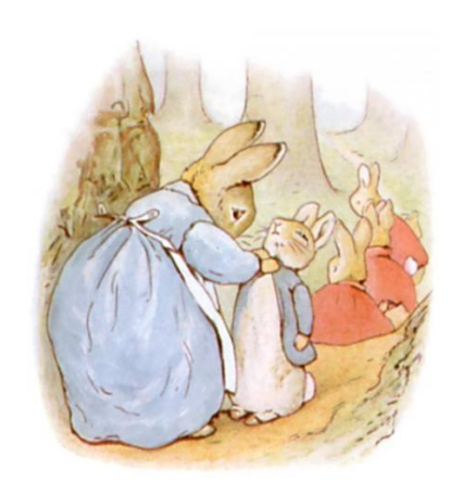
Illustration of Peter Rabbit with his family, from The Tale of Peter Rabbit, by Beatrix Potter dated 1901. Image online, courtesy Project Gutenberg. See the <u>fully illustrated eBook at Project Gutenberg</u>.

It is much more satisfactory to address a real live child; I often think that that was the secret of the success of Peter Rabbit, it was written to a child - not made to order!