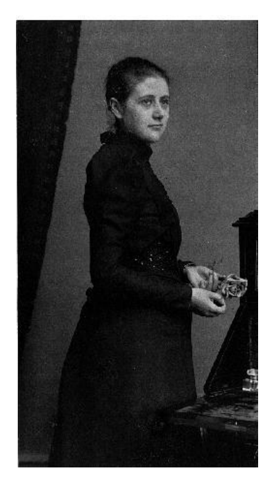
Beatrix Potter - As a Young Woman Image online, courtesy Wikimedia Commons. View this asset at: <a href="http://www.awesomestories.com/asset/view/Beatrix-Potter-As-a-Young-Woman">http://www.awesomestories.com/asset/view/Beatrix-Potter-As-a-Young-Woman</a>