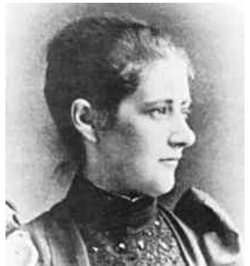
Miss Potter - Portrait in Her Youth View this asset at: <a href="http://www.awesomestories.com/asset/view/Miss-Potter-Portrait-in-Her-Youth">http://www.awesomestories.com/asset/view/Miss-Potter-Portrait-in-Her-Youth</a>