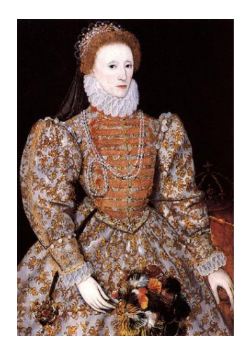
Elizabeth - Portrait Image online courtesy, Wikimedia Commons. View this asset at: <a href="http://www.awesomestories.com/asset/view/Elizabeth-Portrait">http://www.awesomestories.com/asset/view/Elizabeth-Portrait</a>