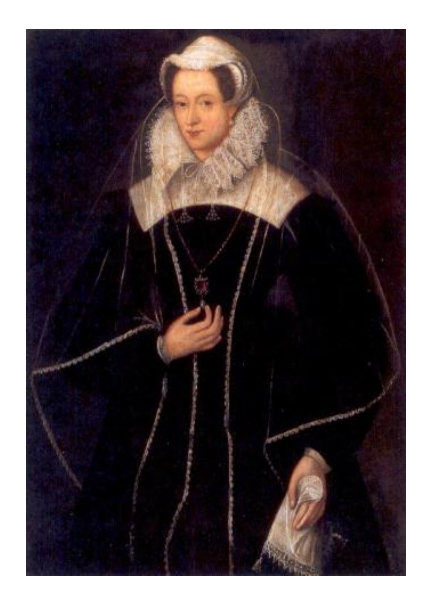
Mary, Queen of Scots - Portrait Image online, courtesy Wikimedia Commons. PD