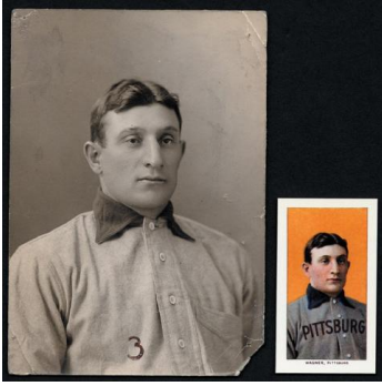
<u>Honus Wagner</u> Image online, courtesy Library of Congress. View this asset at: <a href="http://www.awesomestories.com/asset/view/Honus-Wagner">http://www.awesomestories.com/asset/view/Honus-Wagner</a>

http://www.awesomestories.com/asset/view/1887-Baseball-Card-John-Clarkson-Boston-Beaneaters