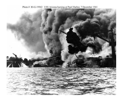
Arizona - On Fire, 7 December 1941

http://www.awesomestories.com/asset/view/Arizona-Explosion-of-Her-Forward-Magazines