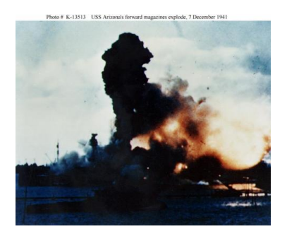
<u>Arizona - Explosion of Her Forward Magazines</u>