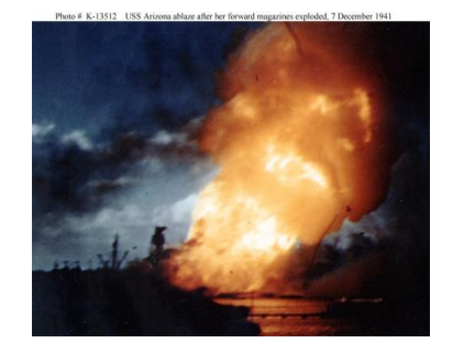
<u> Arizona - Explosive Fireball</u>