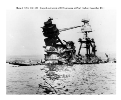
<u> Arizona - Wreckage Entombed Sailors</u>

http://www.awesomestories.com/asset/view/Arizona-Sinking-after-Explosion