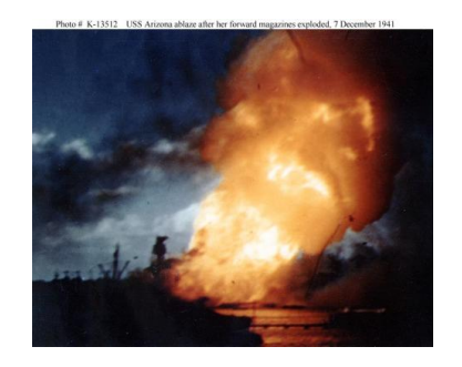
<u>USS ARIZONA</u> View this asset at: <a href="http://www.awesomestories.com/asset/view/USS-ARIZONA">http://www.awesomestories.com/asset/view/USS-ARIZONA</a>