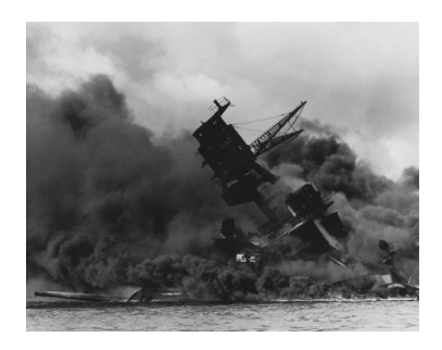
Arizona - Sinking after Explosion

View this asset at: <a href="http://www.awesomestories.com/asset/view/Arizona-Explosive-Fireball">http://www.awesomestories.com/asset/view/Arizona-Explosive-Fireball</a>