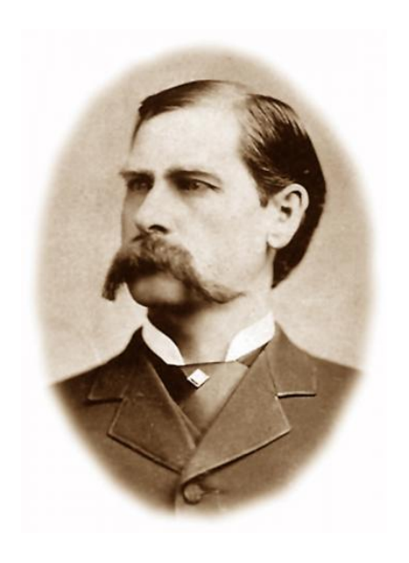
Wyatt Earp

View this asset at: <a href="http://www.awesomestories.com/asset/view/Wyatt-Earp1">http://www.awesomestories.com/asset/view/Wyatt-Earp1</a>