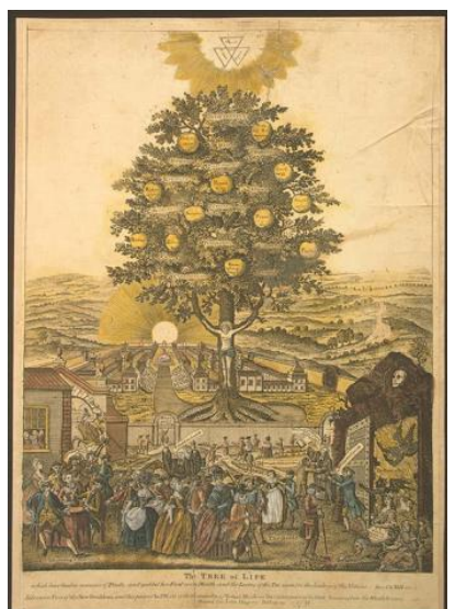
Image online, courtesy the U.S. Library of Congress. View this asset at: http://www.awesomestories.com/asset/view/Gang-Attacked-the-Baptist-Preachers

<u>Tree of Life</u> Image online, courtesy the U.S. Library of Congress. View this asset at: <u>http://www.awesomestories.com/asset/view/Tree-of-Life</u>