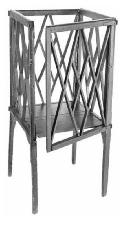
Image online, courtesy the U.S. Library of Congress. View this asset at: http://www.awesomestories.com/asset/view/Circuit-Riding-Preacher

<u>Moveable Pulpits</u> Image online, courtesy the U.S. Library of Congress. View this asset at: <u>http://www.awesomestories.com/asset/view/Moveable-Pulpits</u>