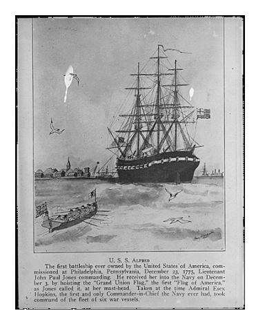
Battleship U.S.S. Alfred