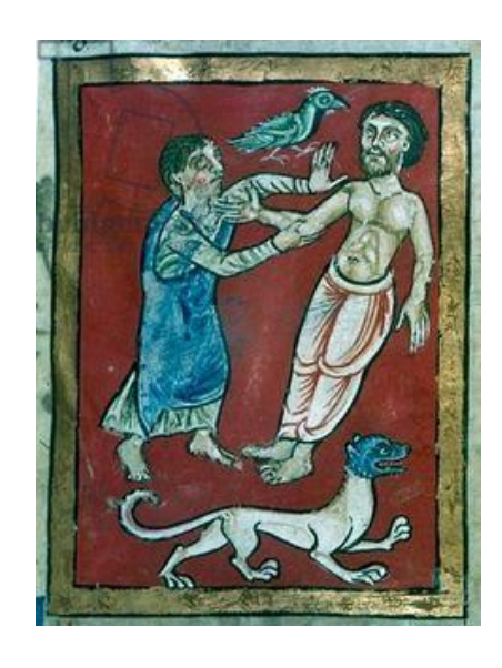
RABIES in ANCIENT TIMES

View this asset at: <a href="http://www.awesomestories.com/asset/view/">http://www.awesomestories.com/asset/view/</a>