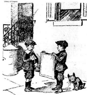
"Did ya get that for yer birthday? Gee! that's some hankachif." "Yeh, me mother made it for me. It's good for a hundred sneezes."... The New York World tried to find some humor in the epidemic.

In the midst of all the Spanish-Flu-caused chaos, people needed to find humor somewhere. This image, of a cartoon published in the New York World , provides an example.