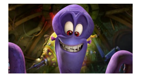
Dave the Octopus

View this asset at: <a href="http://www.awesomestories.com/asset/view/">http://www.awesomestories.com/asset/view/</a>