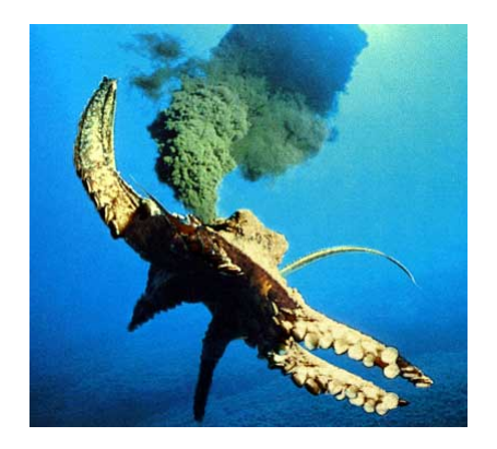
Common Octopus Emitting Ink

View this asset at: <a href="http://www.awesomestories.com/asset/view/">http://www.awesomestories.com/asset/view/</a>