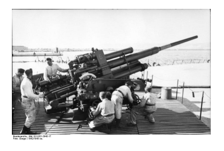
10.5 cm FlaK 38 German Anti-aircraft Gun

View this asset at: <a href="http://www.awesomestories.com/asset/view/">http://www.awesomestories.com/asset/view/</a>