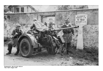
2 cm Flak 30 German Anti-aircraft Gun

View this asset at: <a href="http://www.awesomestories.com/asset/view/">http://www.awesomestories.com/asset/view/</a>