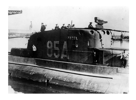
Polish Submarine ORP Orzel

View this asset at: <a href="http://www.awesomestories.com/asset/view/">http://www.awesomestories.com/asset/view/</a>