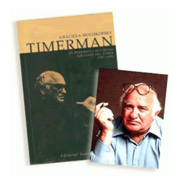
Twenty Years Later Graciela Mochkofsky

View this asset at: http://www.awesomestories.com/asset/view/Twenty-Years-Later