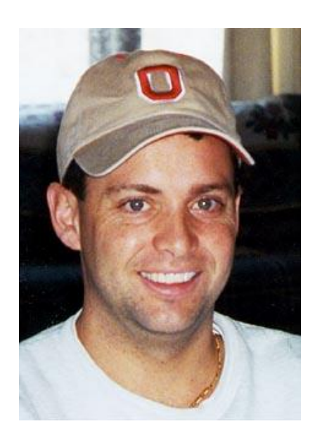
Flight 93 - Todd Beamer Image online, courtesy USATODAY. View this asset at: <a href="http://www.awesomestories.com/asset/view/Flight-93-Todd-Beamer">http://www.awesomestories.com/asset/view/Flight-93-Todd-Beamer</a>

http://www.awesomestories.com/asset/view/Flight-93-Thomas-Burnett