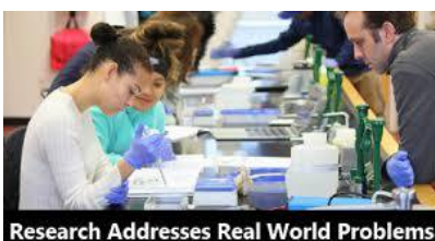
Research Addresses Real World Problems