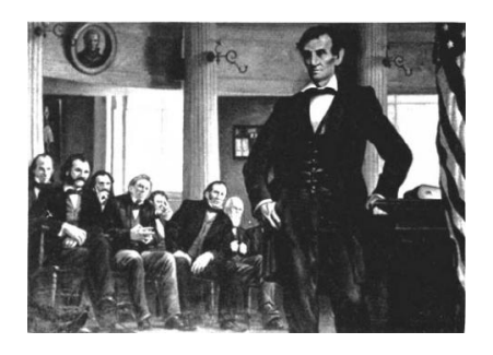
<u>Lincoln</u> Abraham Lincoln Collectibles, View this asset at: <a href="http://www.awesomestories.com/asset/view/Lincoln">http://www.awesomestories.com/asset/view/Lincoln</a>