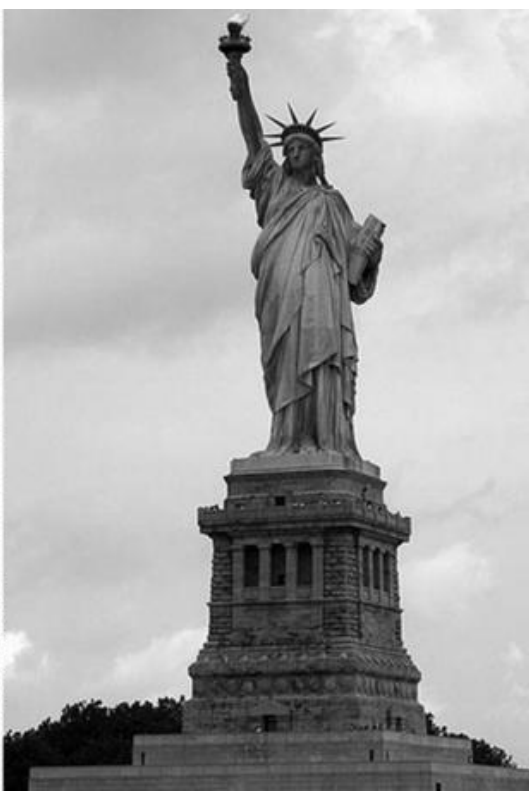
The C. Digital image. Ancient Origins. N.p.,