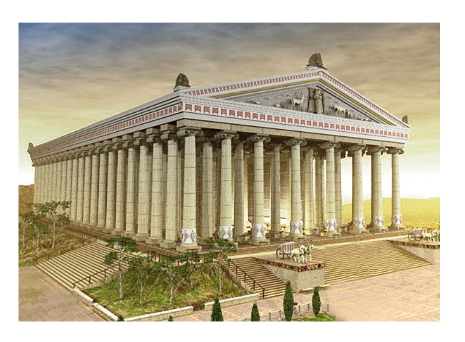
The Temple of Artemis.

The Temple of Artemis was dedicated to Artemis (goddess of the hunt, forests and hills, the moon, and archery). The construction began at about 250 B.C. but was destroyed at about 262 A.D. If it were still standing, it would be somewhere in modern day Turkey. It was built with 60 ft. Ionic columns. This was Antipater of Sidon's favorite ancient wonder.