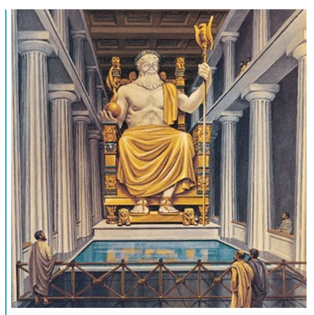
The Statue of Zeus at Olympia. Digital image. Famous