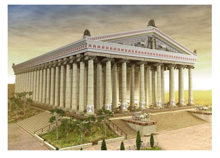
The Temple of Artemis Ephesus.ws, Ephesus.ws View this asset at: <a href="http://www.awesomestories.com/asset/view/The-Temple-of-Artemis0">http://www.awesomestories.com/asset/view/The-Temple-of-Artemis0</a>