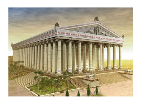
The Temple of Artemis Ephesus.ws, Ephesus.ws View this asset at: <a href="http://www.awesomestories.com/asset/view/The-Temple-of-Artemis0">http://www.awesomestories.com/asset/view/The-Temple-of-Artemis0</a>