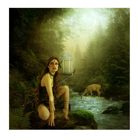
<u>Artemis</u> Greek Mythology and Deviant Art, ViolScraper View this asset at: <a href="http://www.awesomestories.com/asset/view/Artemis1">http://www.awesomestories.com/asset/view/Artemis1</a>